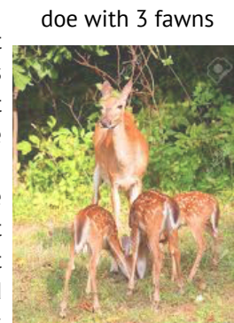
doe with 3 fawns