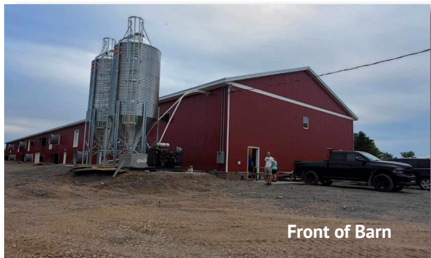
Front of Barn