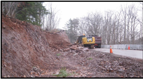
Deep Hollow Road under construction.