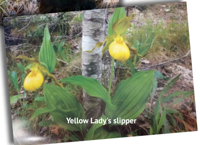
Yellow Lady's slipper

The Northern Saw-whet Owl is a small owl with a catlike face, oversized head without ear tufts and bright yellow eyes. It is named for its repeated tooting whistle call often compared to the sound of a saw being sharpened on a whetstone.